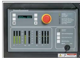
PowerCommand 2100 control operator/display panel