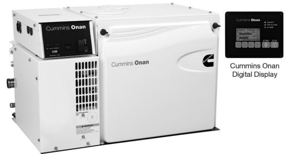
Cummins Onan Digital Display