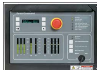
PowerCommand 2100 control operator/display panel