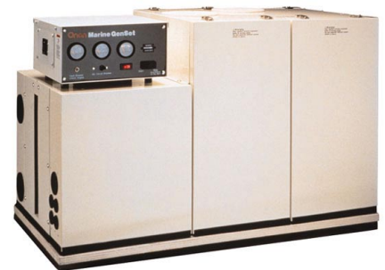
Onan Optional Sound Shield