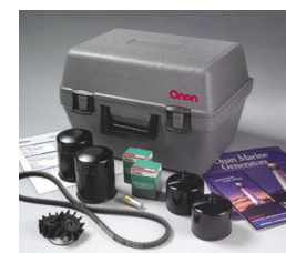
Optional Cruise Kit